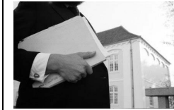
fig. 2. Rational Market value