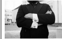
fig. 3. Hedge fund