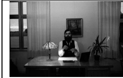
fig. 1. Behavioural Finance