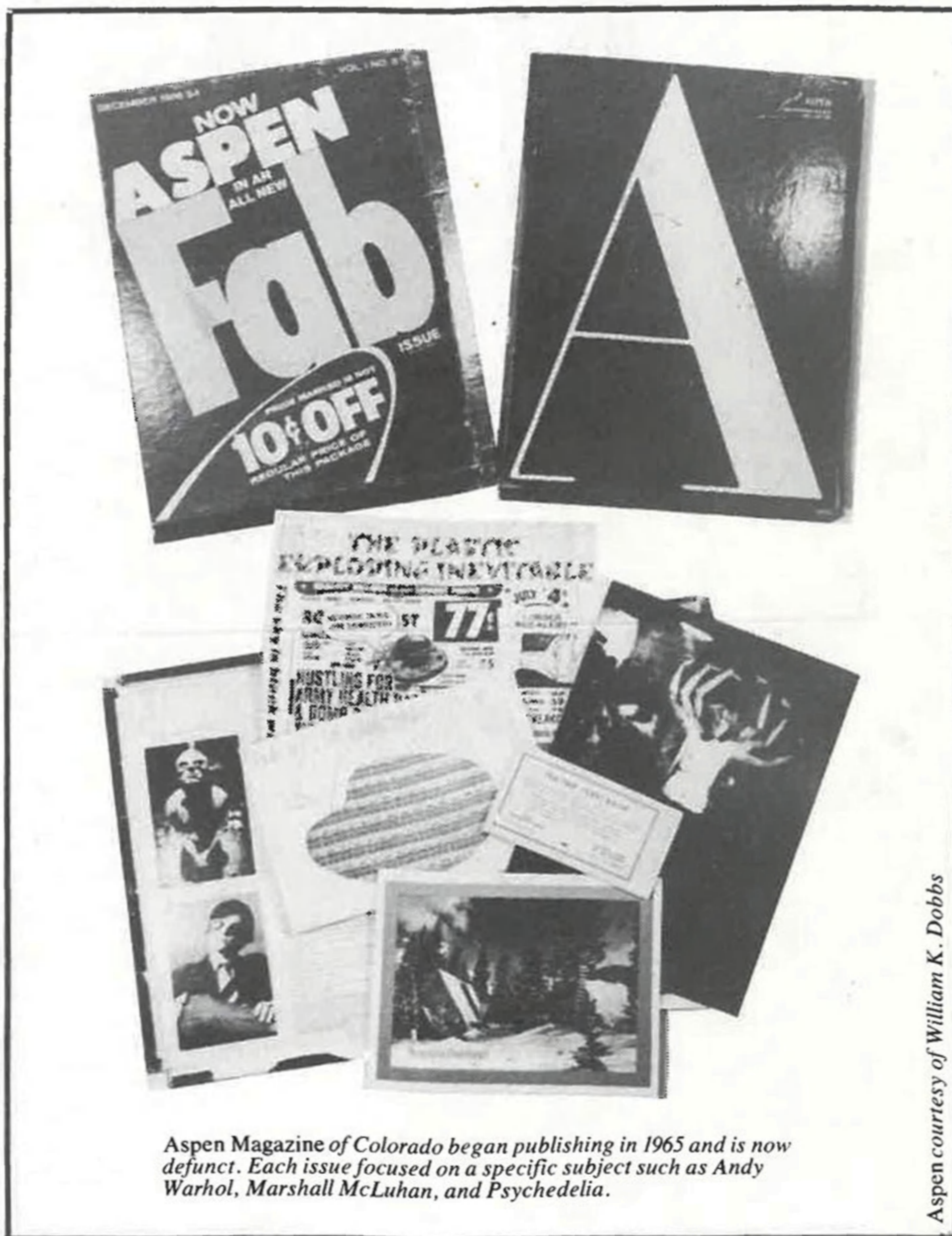
Aspen Magazine of Colorado began publishing in 1965 and is now defunct. Each issue focused on a specific subject such as Andy Warhol, Marshall McLuhan, and Psychedelia.

I T WOULD BE AN exaggeration to trace everything to Howl , but as so many truths are exaggerations of their own fact, the history of interaction between art, literature and alternate publishing were typified in that work. That interaction, centered on the Beat movement, attended by wide contro-