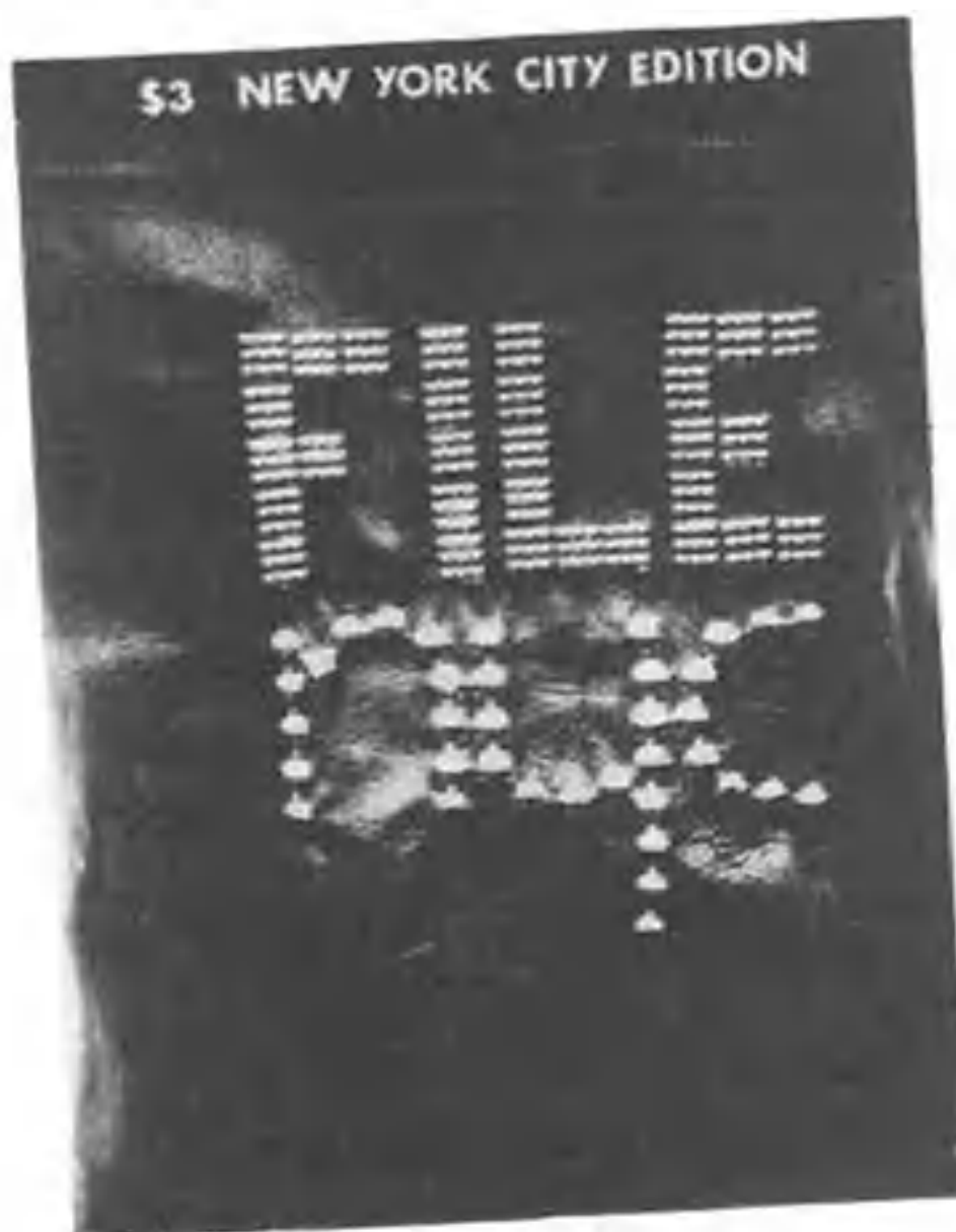
File Magazine always poses form before content in an art-as-life context. Contact: Art Metropole, 241 Yonge Street, Toronto, CANADA M5B 1N8.

Artists' books and book distribution are now well-presented around the world, in this country through the Franklin Furnace, Printed Matter and other centers. The most recent issue of Dumb Ox magazine is devoted to the phenomenon of artists' books, and includes lists of places where one may acquire and see them.