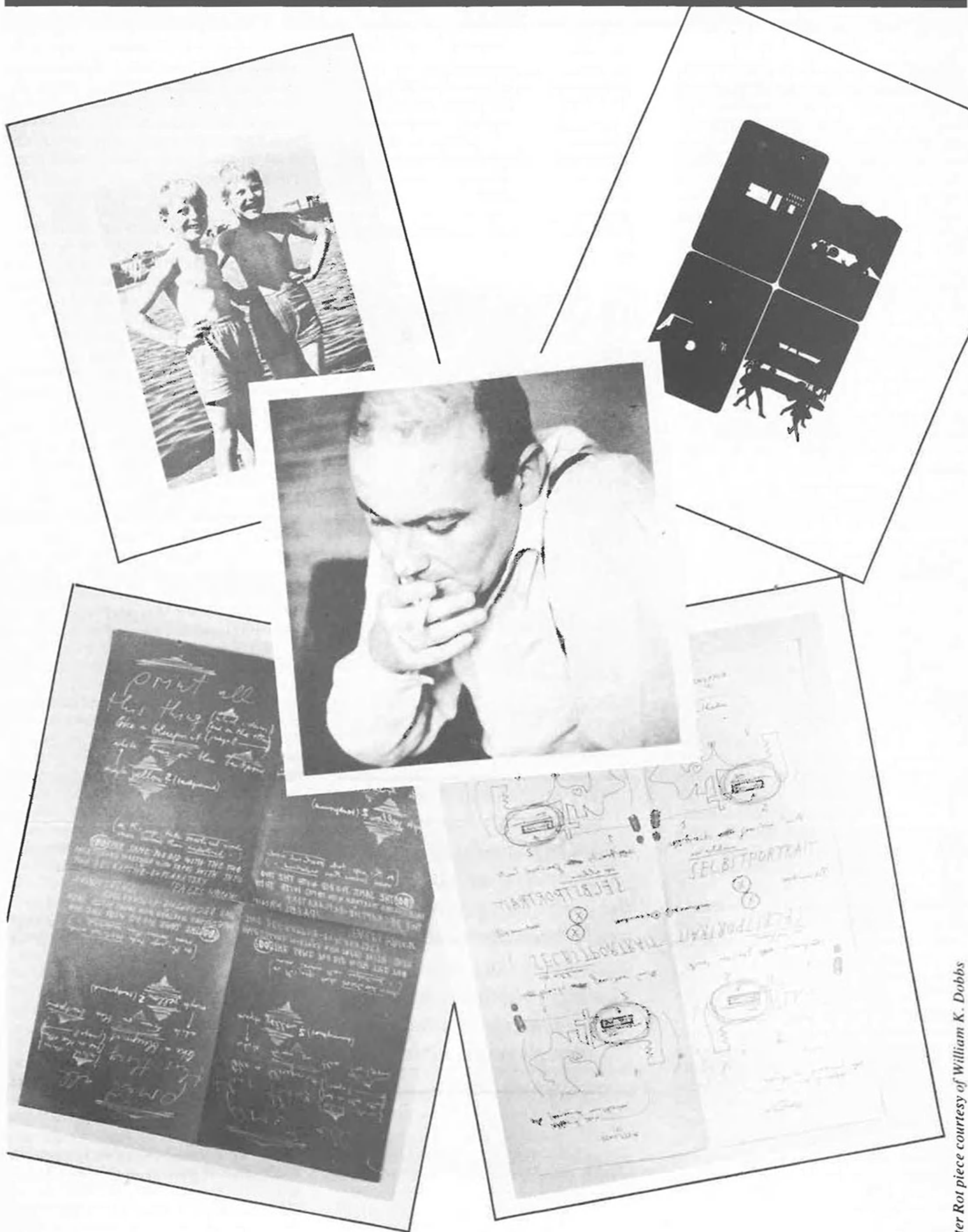
Copley monograph of 1965 on the work of Diter Rot